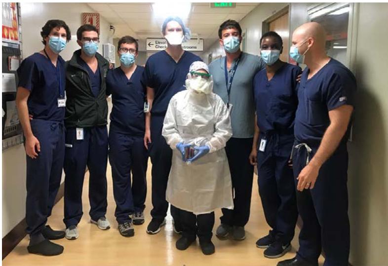
2020 RESIDENT TEACHING AWARD