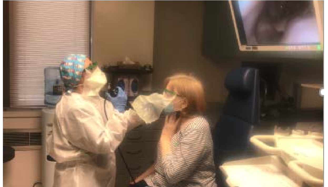
LARYNGEAL STROBOSCOPY 2020